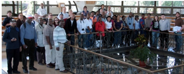
NEC workers in Capernaum